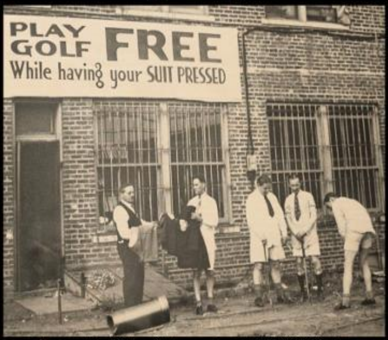
Free round of golf (1 player, 9 holes, no cart, no sun) with $1,000 Sult Pressing