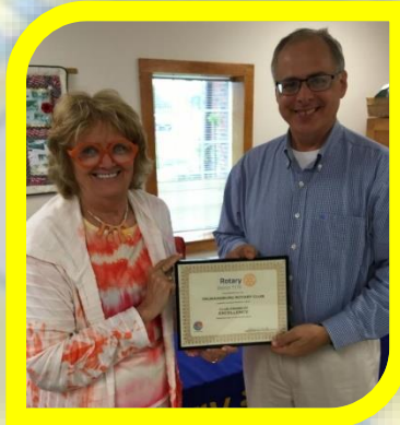
The club received a Club Excellence Award