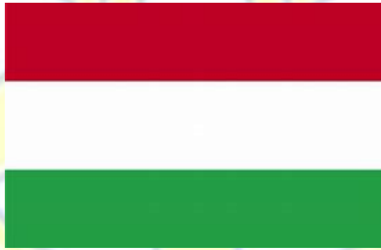
Flag of Hungary