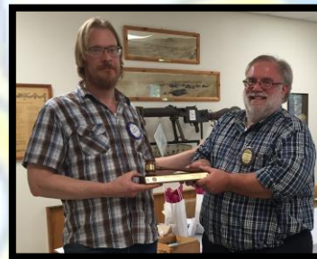
Passing the Gavel