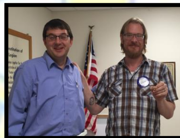
Past President's pin