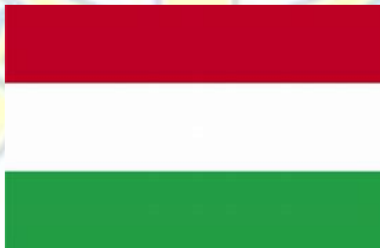
Flag of Hungary