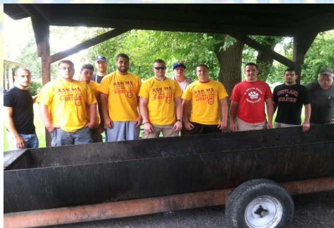
Rugby team helping with Ride for Life