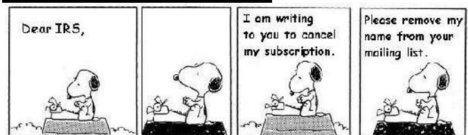
Photo Credit: The late, great Charles M. Schulz, creator of the Peanuts cartoon strip