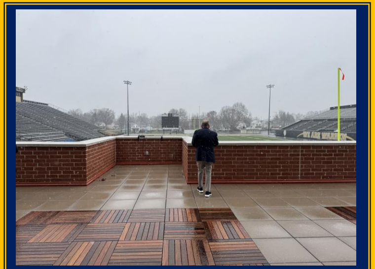
Outdoor Event Space