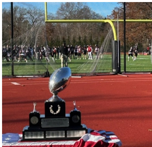
Gorman Centennial Trophy ▲▲▲▲▲ at the Annual Needham/Wellesley Football Game, Thursday, November 23, 2023.