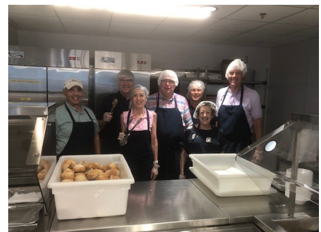
On August 26th, Wellesley Rotarians helped make a meal at the Village Church for veterans at the NE Center for Homeless Veterans in Boston.

The Rotary Club of Wellesley Mission Statement “To serve others with a focus on strengthening communities in the areas of health, education and sustainable living.”