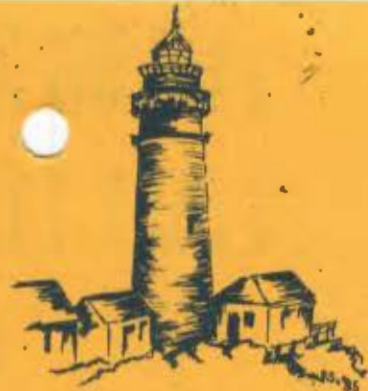
Portland Head Light Cape Elizabeth

South Portland — Cape Elizabeth Rotary Club On the Maine coast