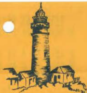
Portland Head Light Cape Elizabeth

South Portland — Cape Elizabeth Rotary Club On the Maine coast