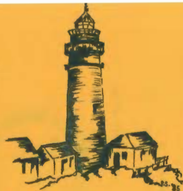
Portland Head Light Cape Elizabeth

South Portland - Cape Elizabeth Rotary Club On the Maine coast