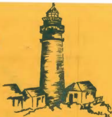
Portland Head Light Cape Elizabeth

South Portland — Cape Elizabeth Rotary Club On the Maine coast