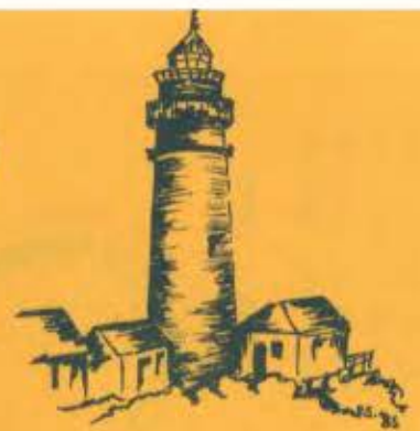
Portland Head Light Cape Elizabeth

South Portland – Cape Elizabeth Rotary Club On the Maine coast