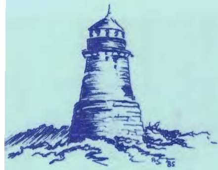
Bug Light South Portland