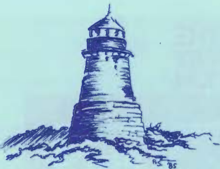
Bug Light South Portland