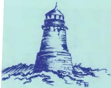
Bug Light South Portland