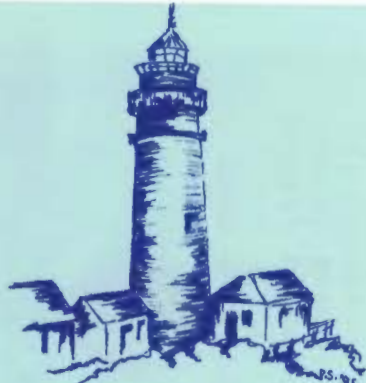
Bug Light South Portland

South Portland - Cape Elizabeth Rotary Club On the Maine coast