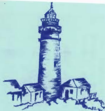
Portland Head Light Cape Elizabeth

South Portland – Cape Elizabeth Rotary Club On the Maine coast