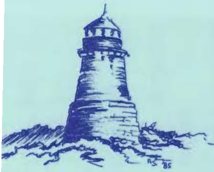
Bug Light South Portland