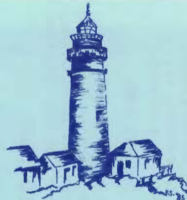
Portland Head Light Cape Elizabeth

South Portland – Cape Elizabeth Rotary Club On the Maine coast