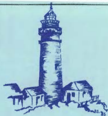
Portland Head Light Cape Elizabeth

South Portland – Cape Elizabeth Rotary Club On the Maine coast