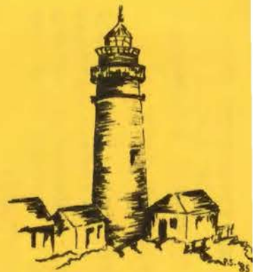
Portland Head Light Cape Elizabeth

South Portland — Cape Elizabeth Rotary Club On the Maine coast