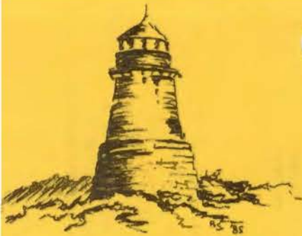
Bug Light South Portland