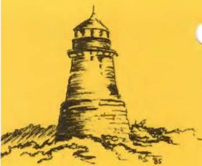
Bug Light South Portland