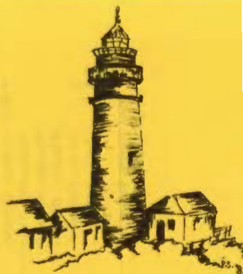
Portland Head Light Cape Elizabeth

South Portland — Cape Elizabeth Rotary Club On the Maine coast