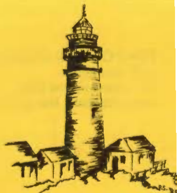
Portland Head Light Cape Elizabeth

South Portland — Cape Elizabeth Rotary Club On the Maine coast