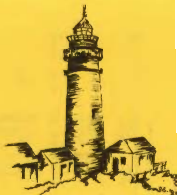
Portland Head Light Cape Elizabeth

South Portland — Cape Elizabeth Rotary Club On the Maine coast