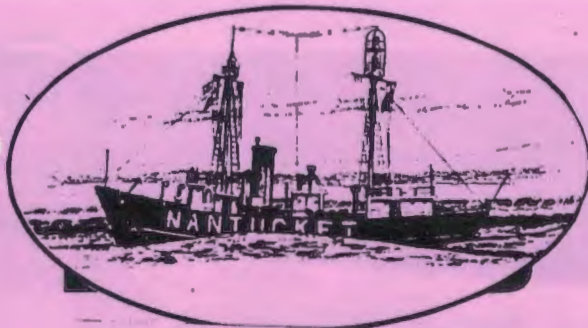
Lightship #112, NANTUCKET