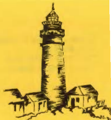
Portland Head Light Cape Elizabeth

South Portland — Cape Elizabeth Rotary Club On the Maine coast