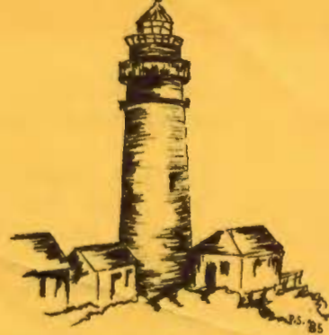
Portland Head Light Cape Elizabeth

South Portland — Cape Elizabeth Rotary Club On the Maine coast