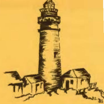
Portland Head Light Cape Elizabeth

South Portland — Cape Elizabeth Rotary Club On the Maine coast