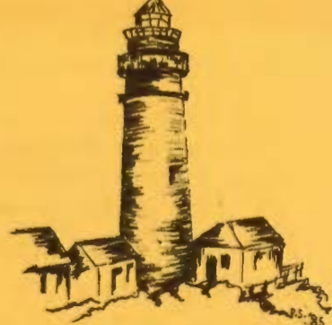
Portland Head Light Cape Elizabeth

South Portland — Cape Elizabeth Rotary Club On the Maine coast