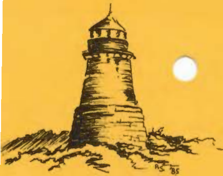
Bug Light South Portland

South Portland — Cape Elizabeth Rotary Club On the Maine coast