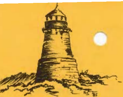
Bug Light South Portland