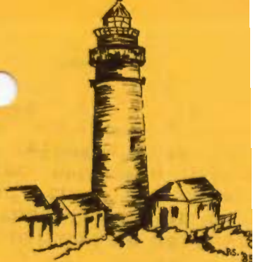
Portland Head Light Cape Elizabeth

South Portland — Cape Elizabeth Rotary Club On the Maine coast