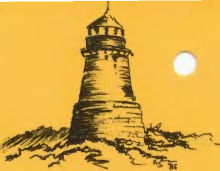
Bug Light South Portland