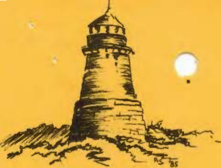
Bug Light South Portland