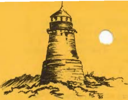
Bug Light South Portland