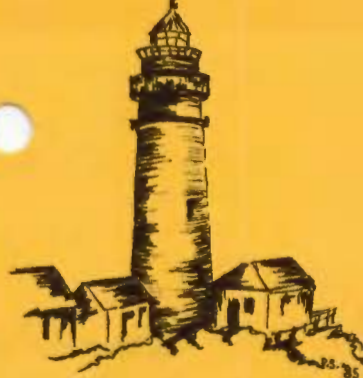
Portland Head Light Cape Elizabeth

South Portland – Cape Elizabeth Rotary Club On the Maine coast