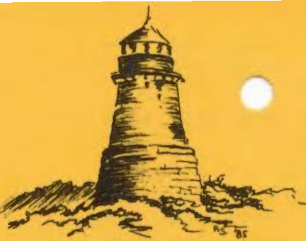
Bug Light South Portland