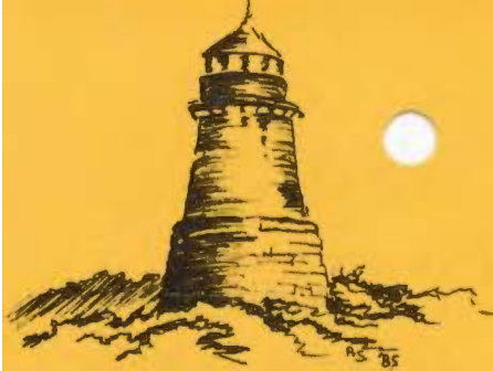
Bug Light South Portland