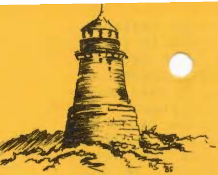
Bug Light South Portland