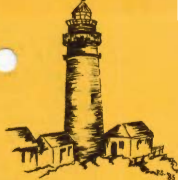
Portland Head Light Cape Elizabeth

South Portland — Cape Elizabeth Rotary Club On the Maine coast