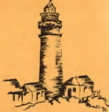
Portland Head Light Cape Elizabeth

South Portland — Cape Elizabeth Rotary Club On the Maine coast