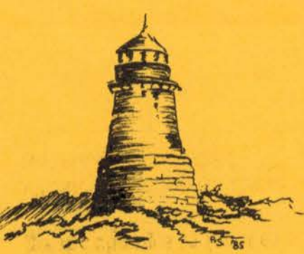
Bug Light South Portland