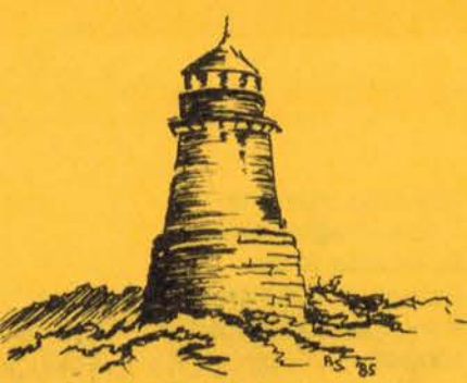
Bug Light South Portland