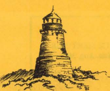
Bug Light South Portland