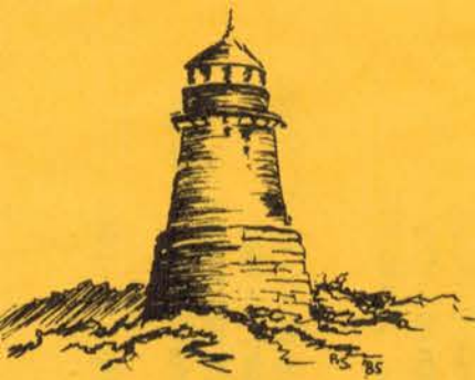
Bug Light South Portland