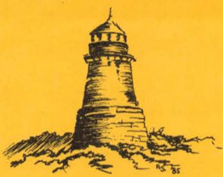
Bug Light South Portland