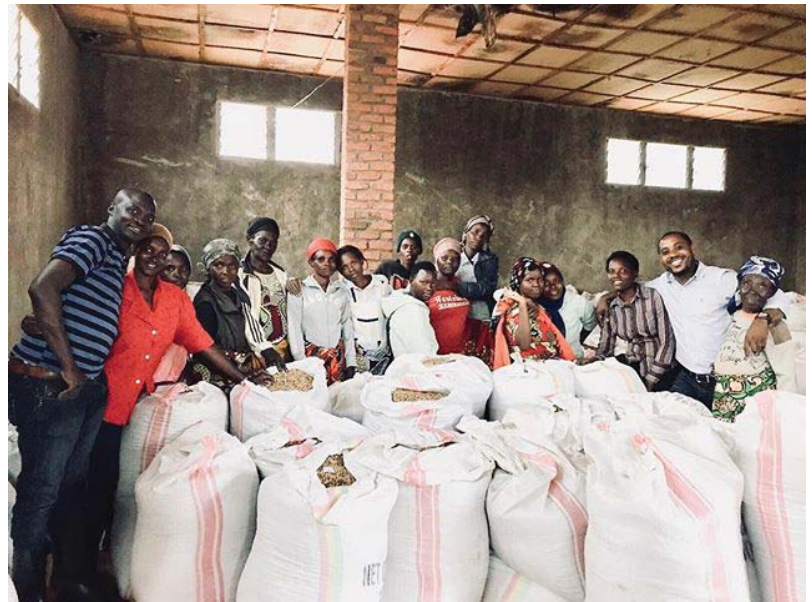
Co-op farmers and their product