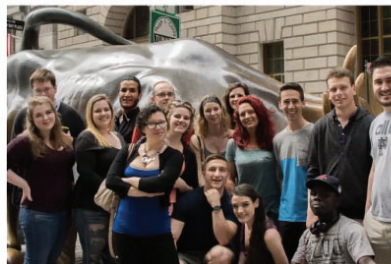
Business club trip to New York City