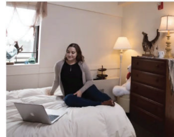
Midcoast Campus Housing – Orion Hall