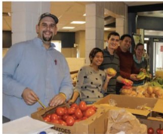
Captain's Cupboard Food Pantry Volunteer Staff