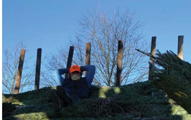
Next year's tree sale chair hard at work!