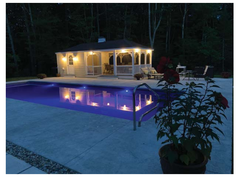
The Schmidts' beautiful backyard at their new home in Scarborough