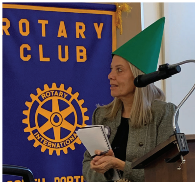
The "Hotel du Gnome" at Verbena!