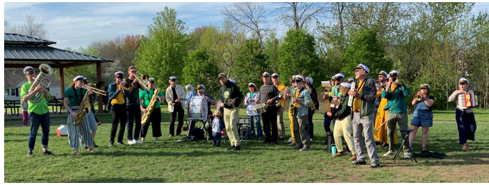
Ideal Maine Social Aid & Sanctuary Band