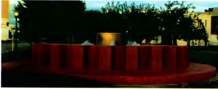
The Rotary Fountain, Downtown Beaumont