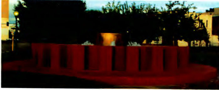
The Rotary Fountain, Downtown Beaumont