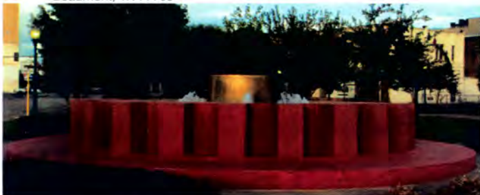
The Rotary Fountain, Downtown Beaumont