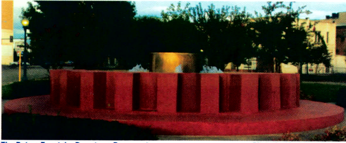
The Rotary Fountain, Downtown Beaumont