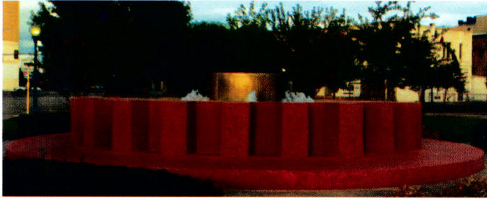
The Rotary Fountain, Downtown Beaumont