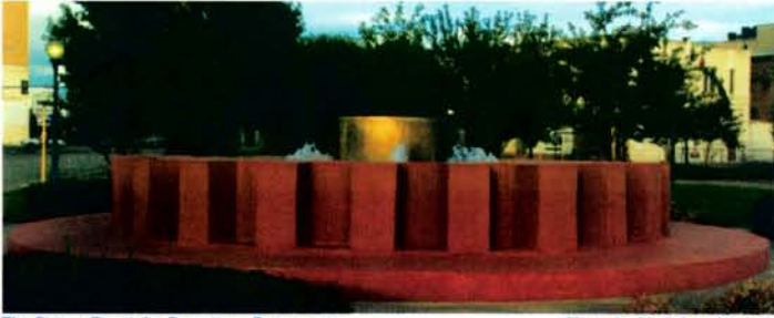
The Rotary Fountain, Downtown Beaumont