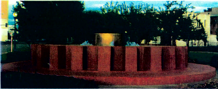
The Rotary Fountain, Downtown Beaumont