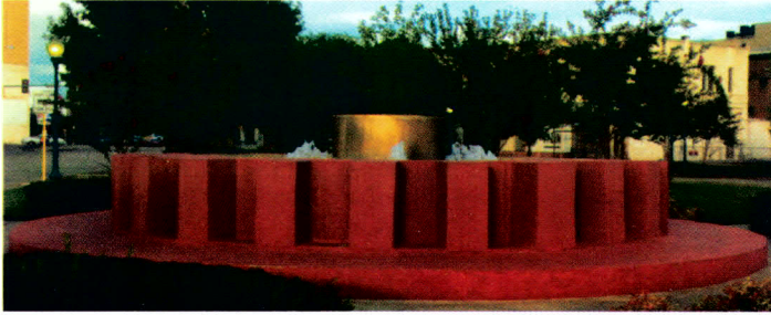
The Rotary Fountain, Downtown Beaumont