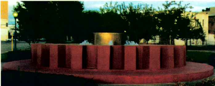
The Rotary Fountain, Downtown Beaumont