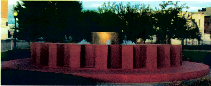
The Rotary Fountain, Downtown Beaumont