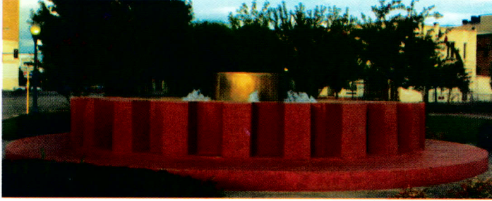
The Rotary Fountain, Downtown Beaumont