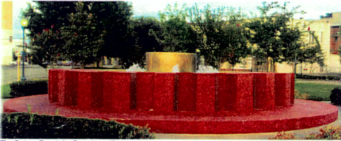
The Rotary Fountain, Downtown Beaumont