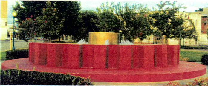
The Rotary Fountain, Downtown Beaumont