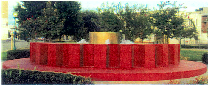
The Rotary Fountain, Downtown Beaumont