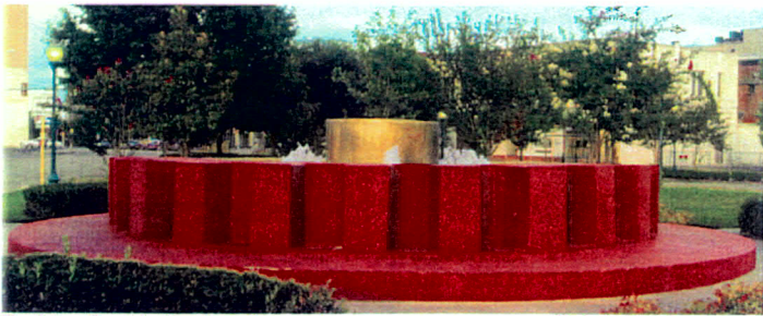
The Rotary Fountain, Downtown Beaumont