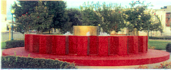
The Rotary Fountain, Downtown Beaumont