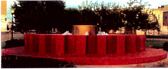
The Rotary Fountain, Downtown Beaumont