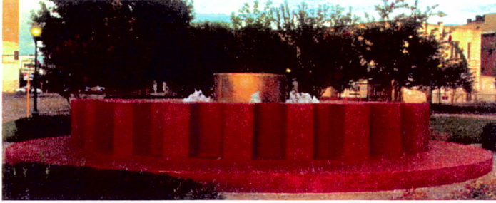
The Rotary Fountain, Downtown Beaumont