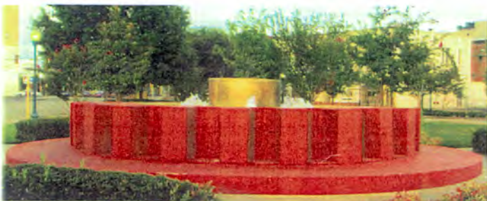
The Rotary Fountain, Downtown Beaumont