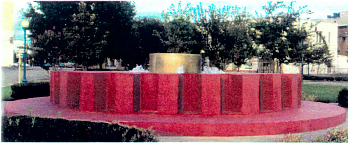
The Rotary Fountain, Downtown Beaumont