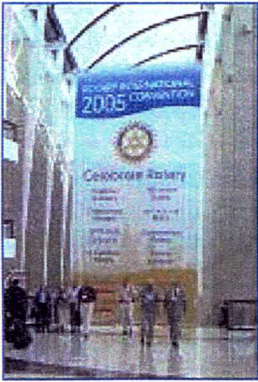
Rotarians were dwarfed by the large welcome banner at the RI Convention in Chicago's McCormick Place.