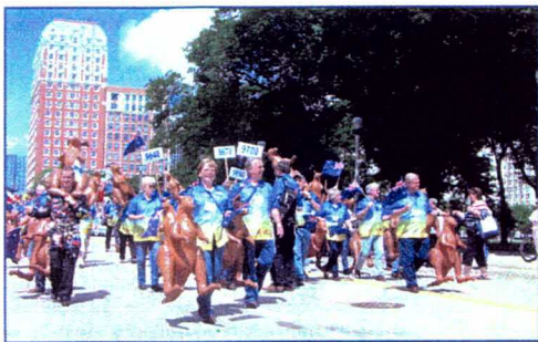
Australian Rotarians with their kangaroos in Chicago RI Convention parade